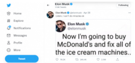
Mr. Musk has, in a subtle way, tried to refute false tweets attributed to him

Based on our review of the screenshot claiming that Elon Musk wants to buy Liberia and a careful search on Mr. Musk’s twitter account where we found no such tweet, we conclude that the tweet is false. It was likely created as a meme but may also be used to mislead users of Facebook.