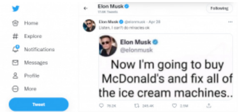
Mr. Musk has, in a subtle way, tried to refute false tweets attributed to him

Based on our review of the screenshot claiming that Elon Musk wants to buy Liberia and a careful search on Mr. Musk’s twitter account where we found no such tweet, we conclude that the tweet is false. It was likely created as a meme but may also be used to mislead users of Facebook.